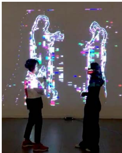
Picture 4. The elements of motion and light are the strengths of new media-based works