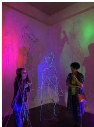
Picture 2. The space of "Two Worlds" represents the phenomena of acceleration and movement

This work conveys a message that nothing is static and certain; objects, human thoughts, speed of progress, shifts in meaning etcetera will continue to change and increase, space becomes dependent on technology which has become part of human life and its dynamics. The space of "Two Worlds" represents the symptoms of acceleration and movement, changes which are increasing, decreasing, changing and even moving. (Picture 2)